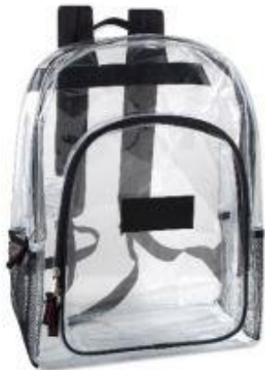
Example of clear backpack with mesh side pockets.

Yes. Mesh side pockets are allowed on the backpack (see example).