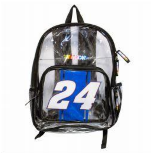
Large logos on backpacks are NOT permitted.