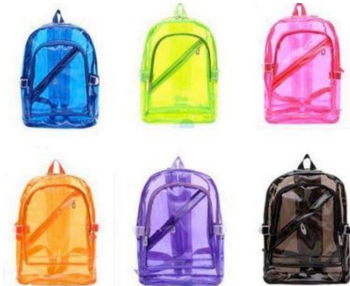
Example of colored transparent backpacks that ARE NOT allowed.