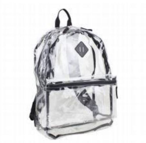
Example of permitted clear backpack.