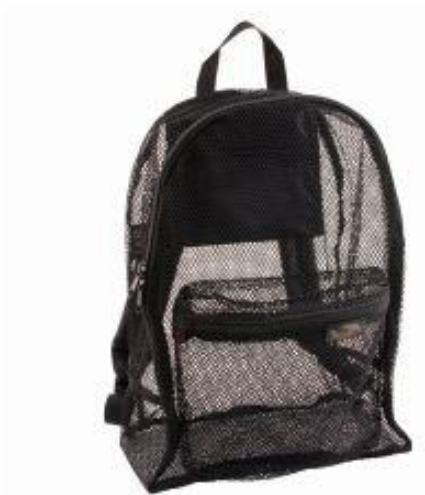
Mesh backpack not permitted.

No. Mesh backpacks are not allowed. Students are permitted to only use clear backpacks.