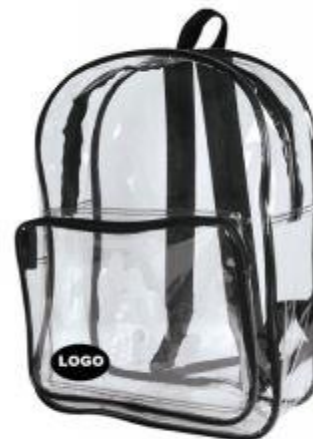
Small logos on backpacks are acceptable.